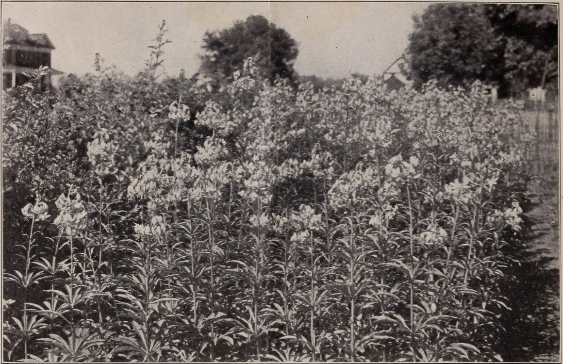
Lilium Hanson Growing in the Garden